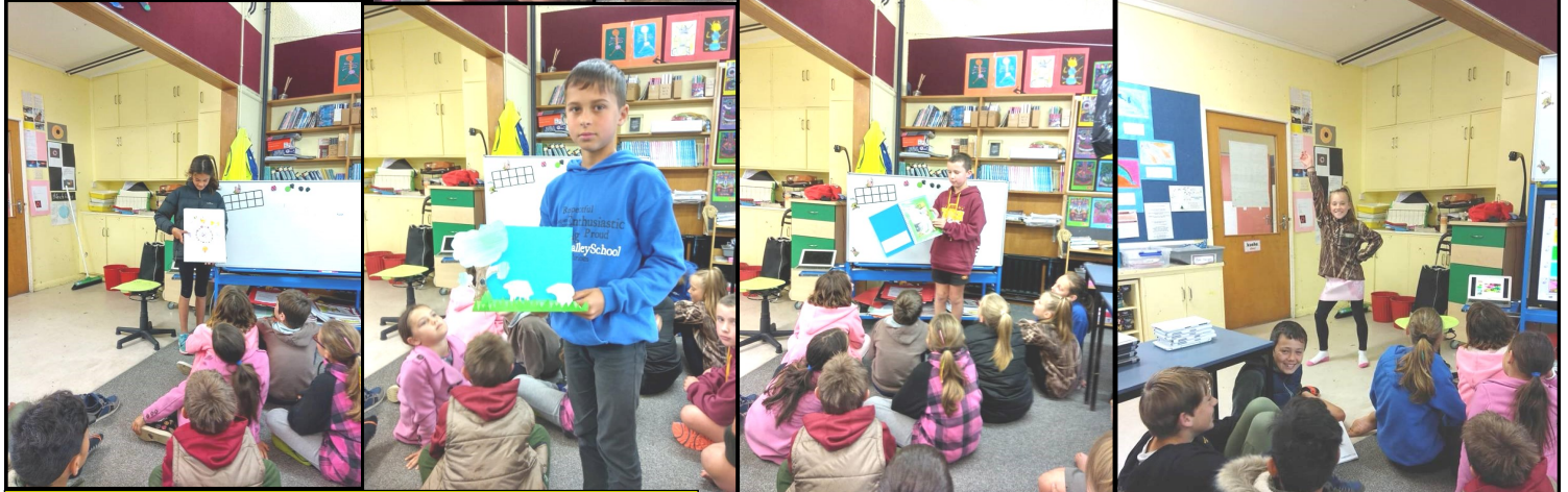
Room 4 shared their Home Learning