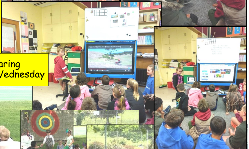
Pod 1 held their sharing Assembly outside last Wednesday